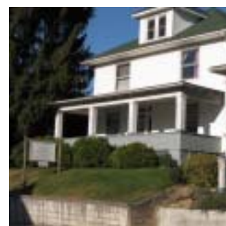
Above: The Philippi Mennonite Meetinghouse, Philippi, WV