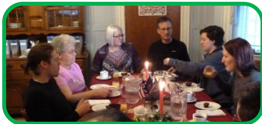
Breakfast shared with guests offers opportunity for multicultural interaction