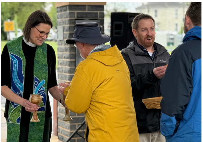
Community Mennonite Church

Through worship, service, and stewardship, congregations across the conference found meaningful ways to honor Earth Day.