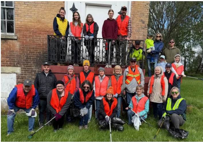
Scottdale Mennonite Church

Congregations across Allegheny Mennonite Conference marked Earth Day through worship and hands-on action, reflecting a shared commitment to caring for God's creation.