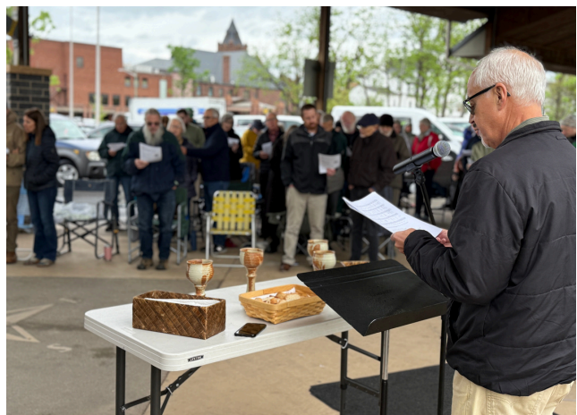
Community Mennonite Church